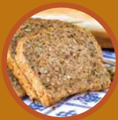
Whole Wheat Bread 全麥麵包