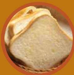
Basic Bread 白麵包

Use German Pool's Bread Makers to bake fresh and additives-free breads at home. Add personalised ingredients to create original and healthy loaves too!