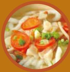
Udon Noodle Dough 烏冬麵糰

圖片只供參考，實際效果可能有所不同。Photos are for reference only, actual results may vary.