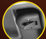
自動酵母投放盒 Auto Yeast Dispenser