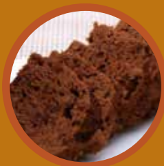
Chocolate Bread 朱古力麵包