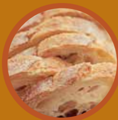
French Bread 法式麵包