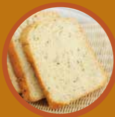
Cheese & Herb Bread 芝士香草麵包